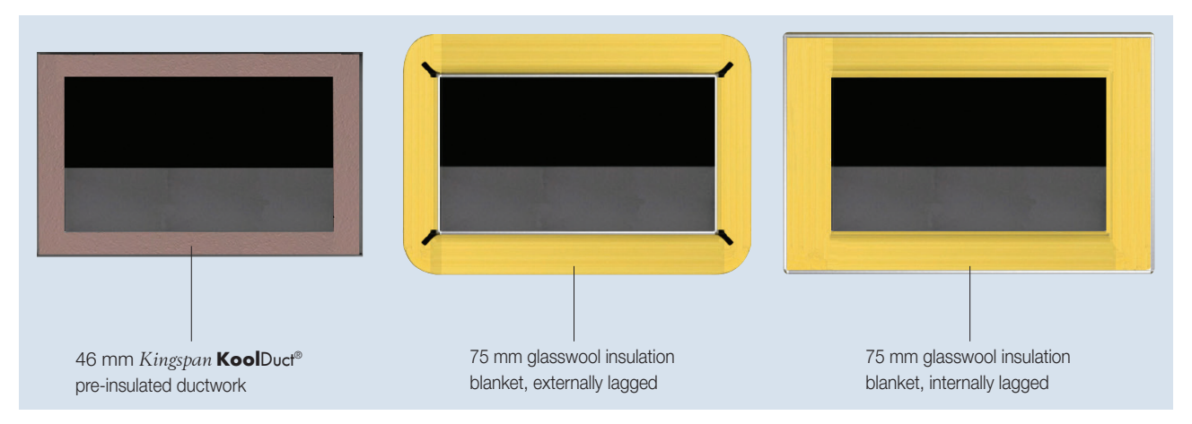
Figure 1 Kingspan KoolDuct® Achieves R2.0 in Just 46 mm Thickness.